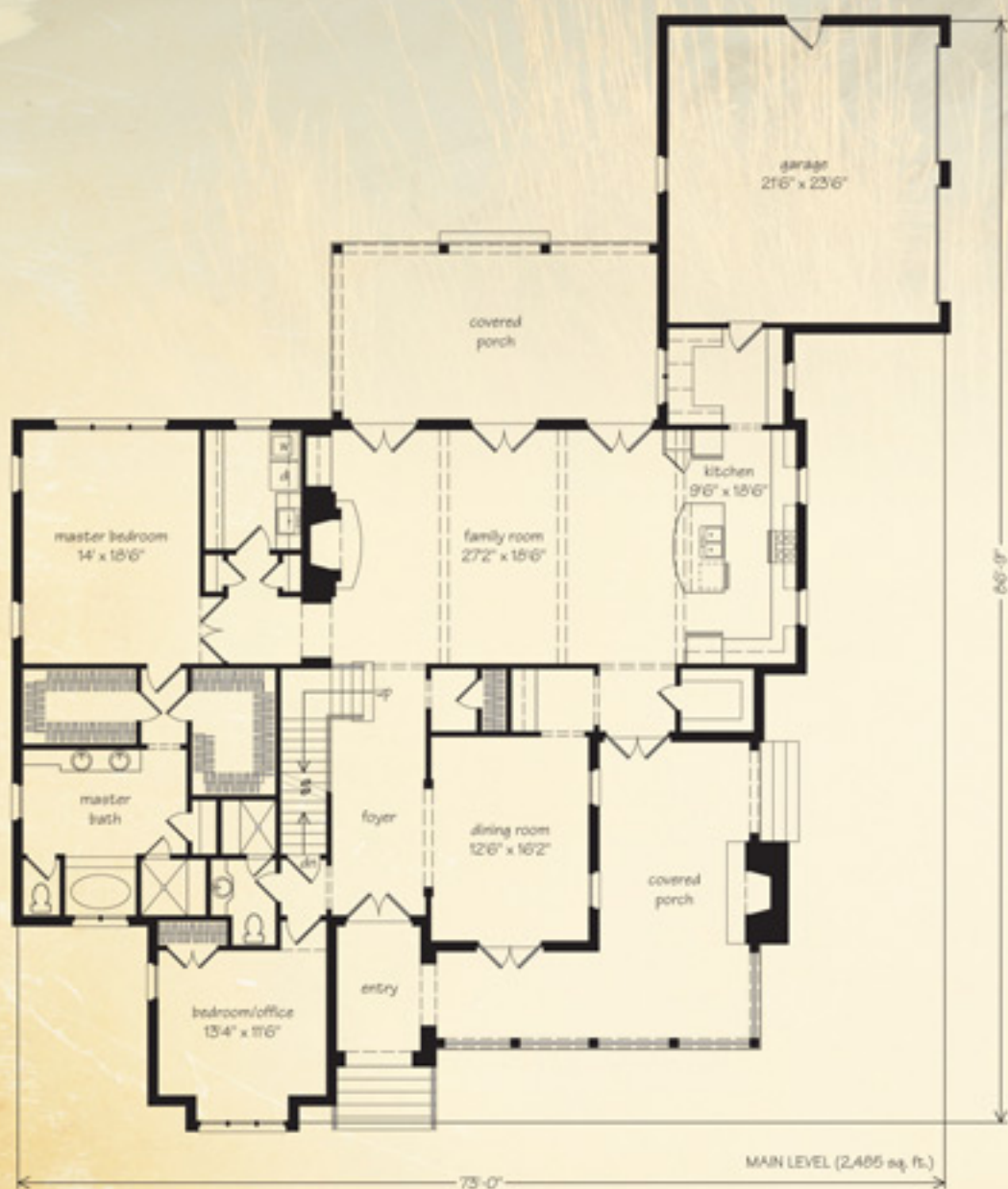
#1561 Elberton: Main Level Floor Plan

The Elberton Way combines English cottage style with design elements that compliment coastal living. The first floor features a spacious kitchen that opens onto a vaulted family room, a guest room, and a large master suite with two separate walk-in closets. The floor plan has excellent flow: An integrated screened rear deck directly off of the family room and large wrap around front porch with optional outdoor fireplace make the transition from outdoor to indoor entertaining seamless. Two additional bedrooms upstairs and a loft provide plenty of room for family and friends.